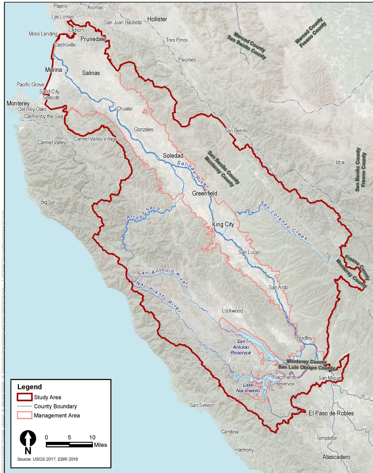
Figure 1-3. Study Area and Management Area Boundaries