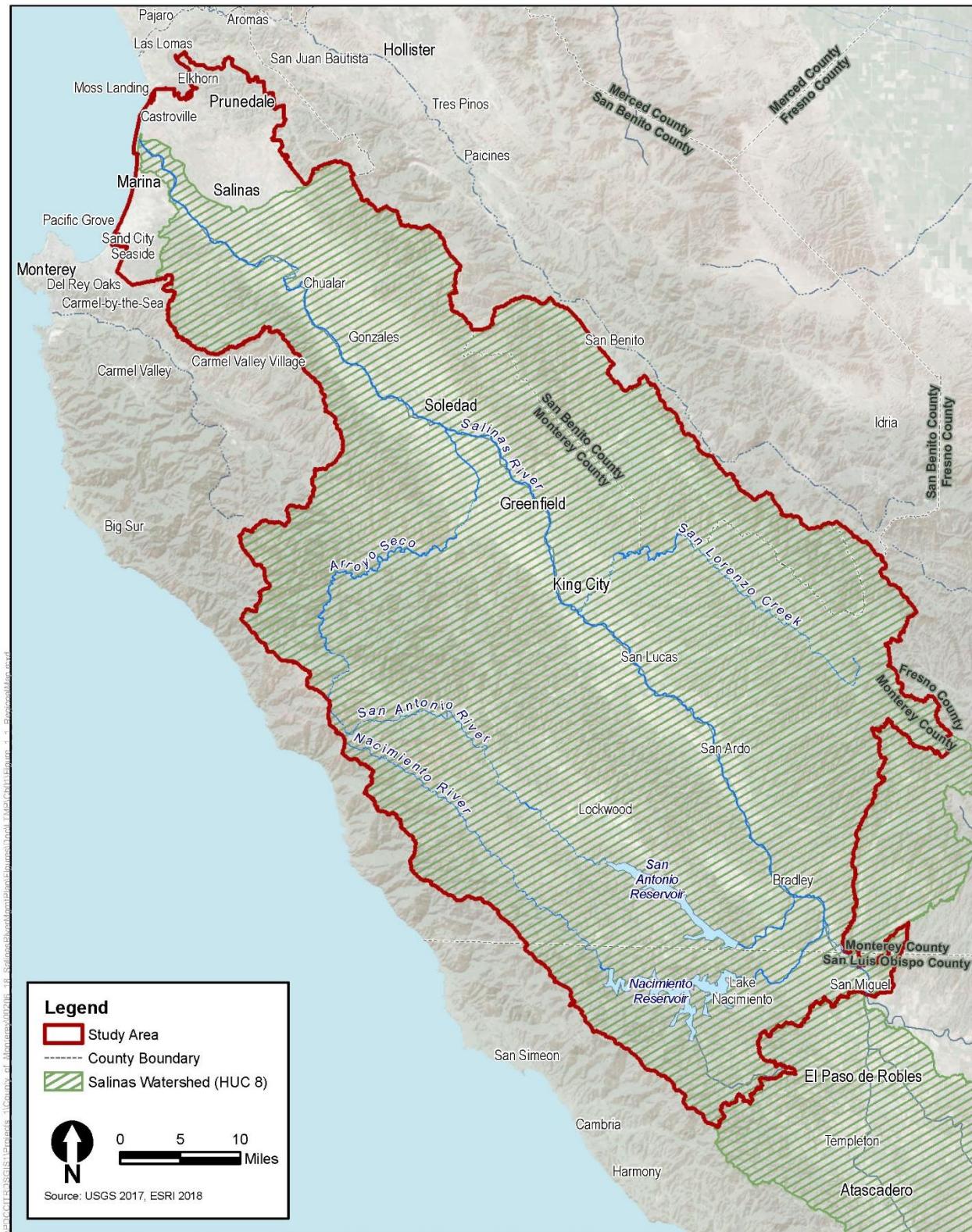
Figure 1-1. Regional Location